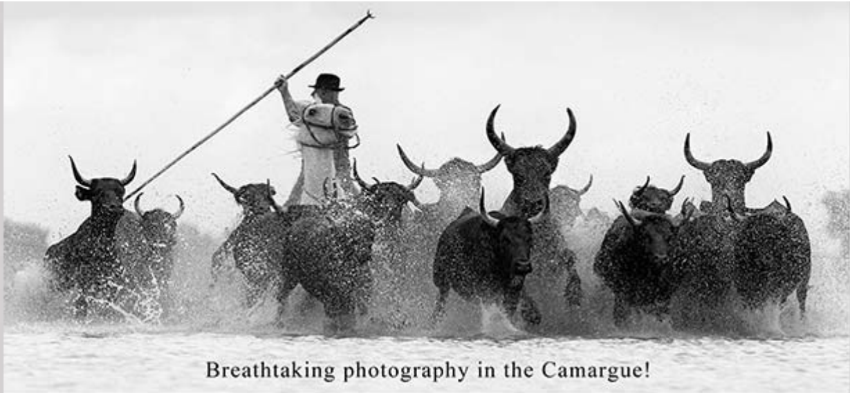
Breathtaking photography in the Camargue!

Looking for a new challenge? We have been working hard to offer you new & exciting destinations with some incredible shoots. New for 2014/15: