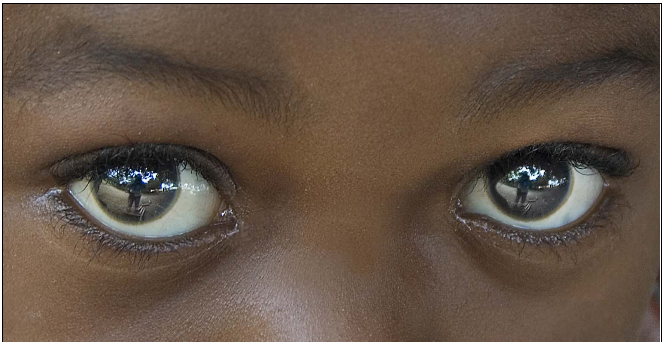
Eyes of Africa by Margaret Salisbury FRPS MFIAP FRPS APAGB FIPF continued on next page