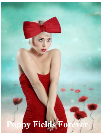
Poppy Fields Forever