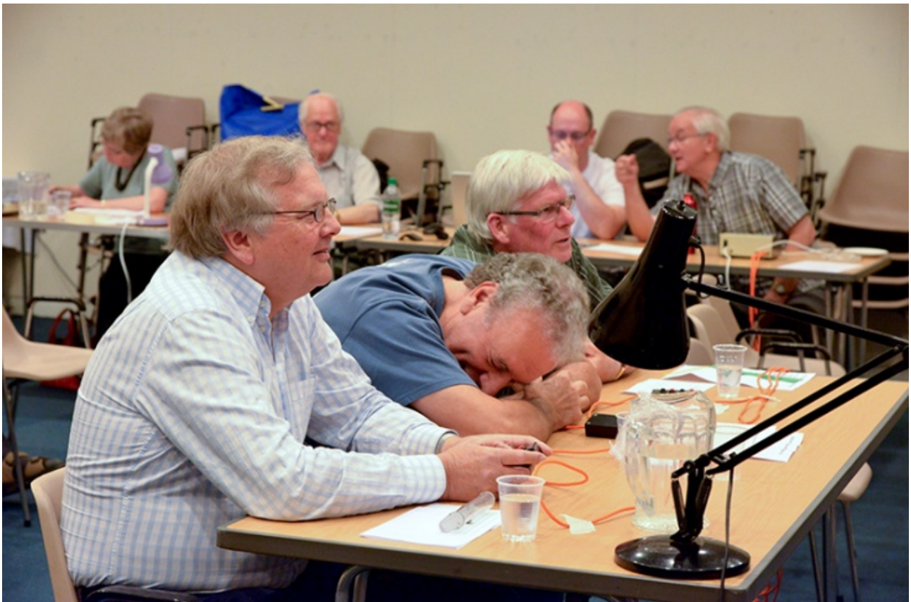
The pressure of judging as 660 images flashed in front of the critical eyes of our experienced judges.