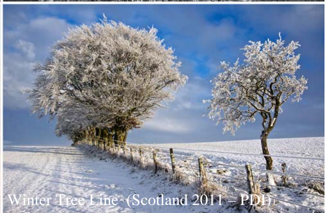
Winter Tree Line (Scotland 2011 - PDI)