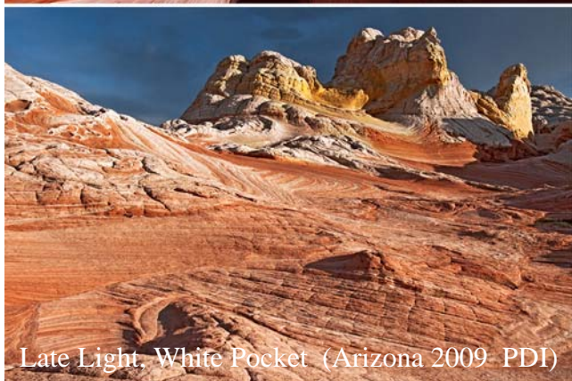
Late Light, White Pocket (Arizona 2009 PDI)