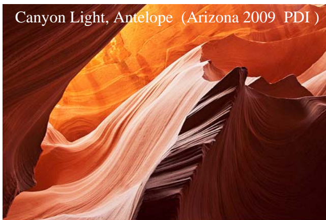
Canyon Light, Antelope (Arizona 2009 PDI)