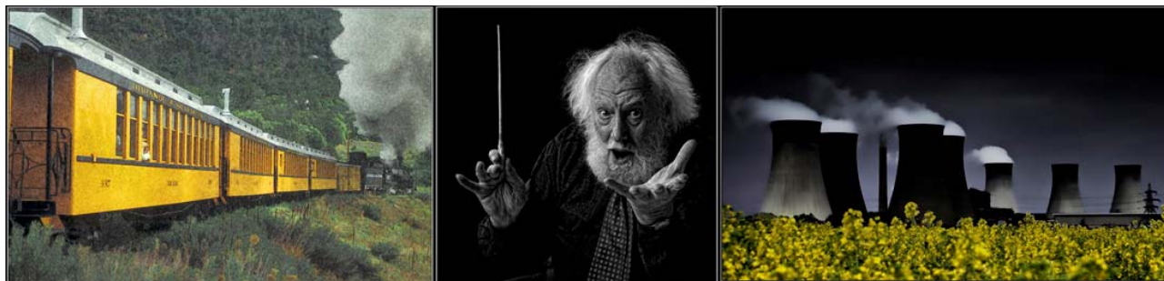
We will profile the other new PAGB judges in later issues.