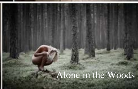
Alone in the Woods