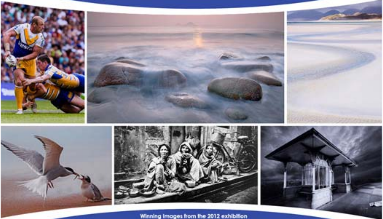
Winning Images from the 2012 exhibition