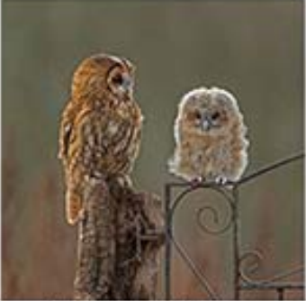
Peter Whieldon, Watchfull Eye jpg