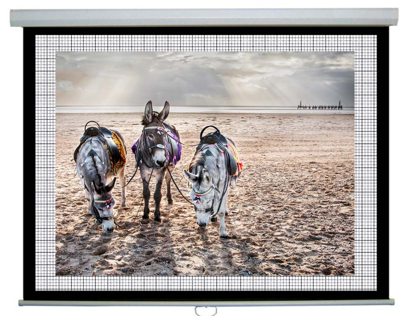
Image shown is 1400x1050. A 1600x1200 would fill the white screen area.

http://www.scottish-photographic-federation.org/guidance