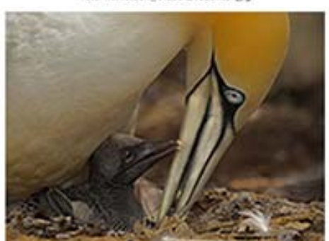
Whieldon Loving Mother jpg