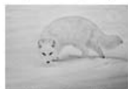
Arctic Fox.jpg