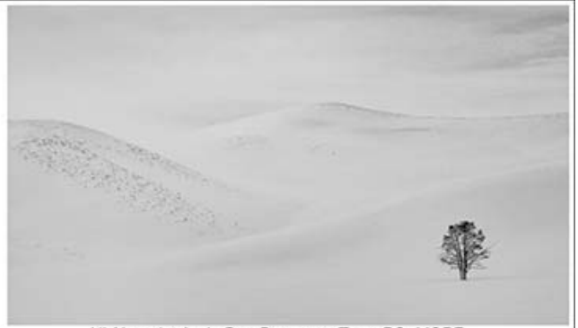
All Alone