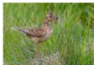
Skylark With Caterpillar by Ian Mitchell, Bon Accord CC, SPF.jpg