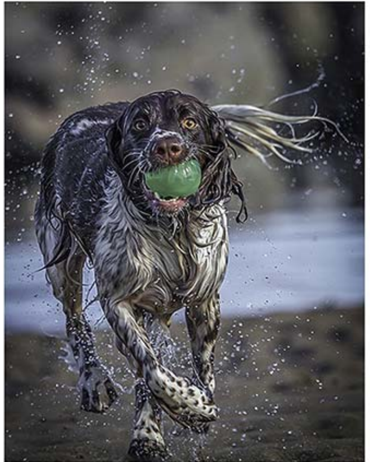
Wet