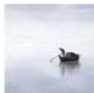
Fishing On The Mekong.jpg