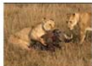
Lioness Catching Warthog.jpg