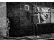
Cocktail In A Can by Jason Hyde, Overton PC, SCPF.jpg