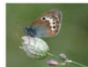
Darwins Heath.jpg