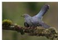
Cuckoo