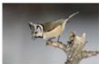
Crested Tit.jpg