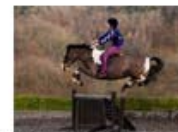
Thelwell Child.jpg