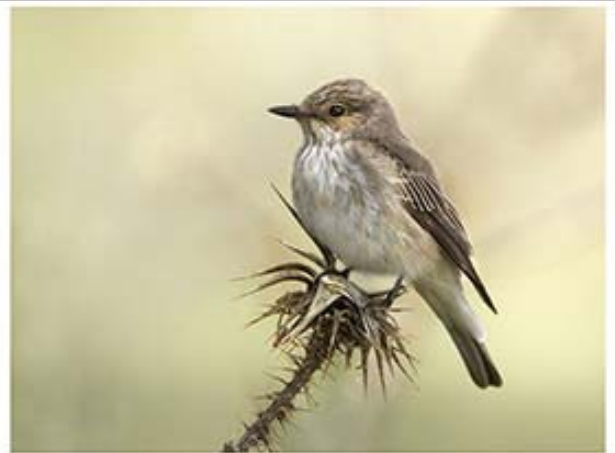
Spotted Flycatcher