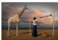
Washing The Patches.jpg