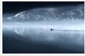
01 Smokedrift. Irene Froy.jpg