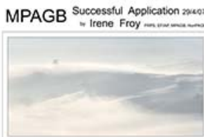
MPAGB Successful Application 29/4/07 by Irene Froy FRS, 2007 MPAGB, 14/07/08 18 Lone Tree in Mist. Irene Froy.jpg