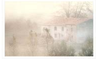
04 French Farmhouse. Irene Froy.jpg