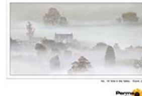
19 Mist in valley. Irene Froy.jpg