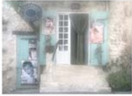
05 Hairdresser's La Begude. Irene Froy.jpg