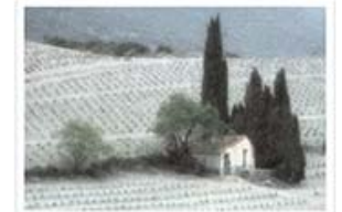
20 Vineyard Cottage in early spring. Irene Froy.jpg

Click anywhere on the panel above to see the pictures on the e-news website.