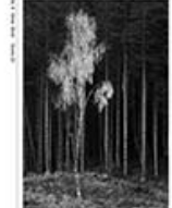
08 Silver Birch. Irene Froy.jpg