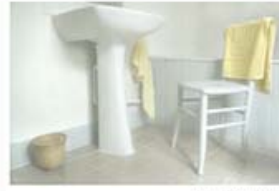
07 Splash of Yellow. Irene Froy.jpg