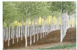
17 Poplars Lines. Irene Froy.jpg