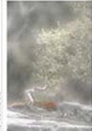
06 Twisted Trunk. Irene Froy.jpg