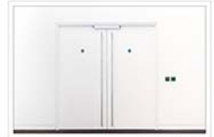
12 The White Door. Irene Froy.jpg