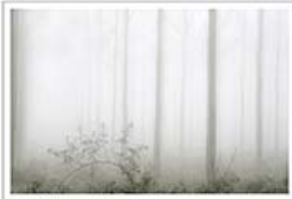
09 Poplars & bramble. Irene Froy.jpg