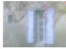
03 Shutters & Ivy. Irene Froy.jpg