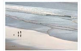
16 Walking the Dog. Irene Froy.jpg