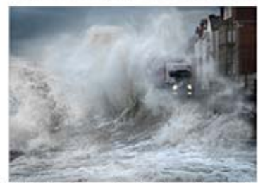
North Sea Surge by Kathryn Scorah.jpg