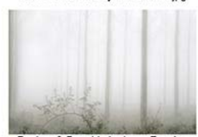
Poplars & Bramble by Irene Froy.jpg