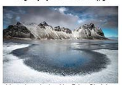
Vesturhorn, Iceland.jpg