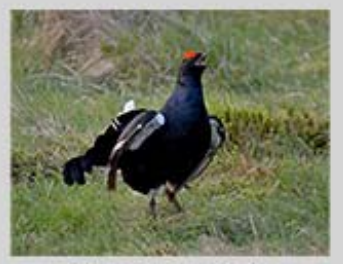
Black Grouse Hide

(Sales - Tuition - Hide Hire - Photography Tours)