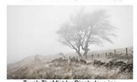
TreeInTheMist.jpg