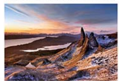
First Light on the Storr by Brian Clark.jpg