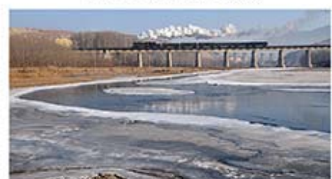
Nanpiao River by Ian Silvester.jpg