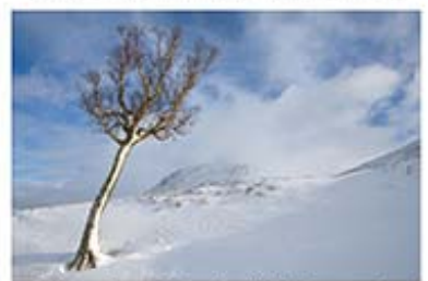
Glenn Shee Tree.jpg