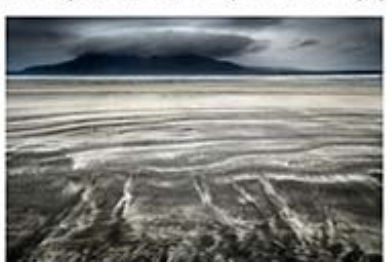
Laig Bay by Peter Paterson.jpg