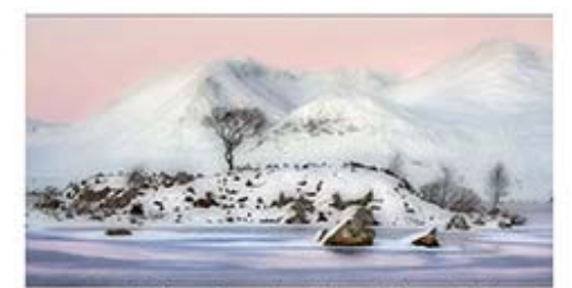
Before Dawn by Hunter Kennedy.jpg