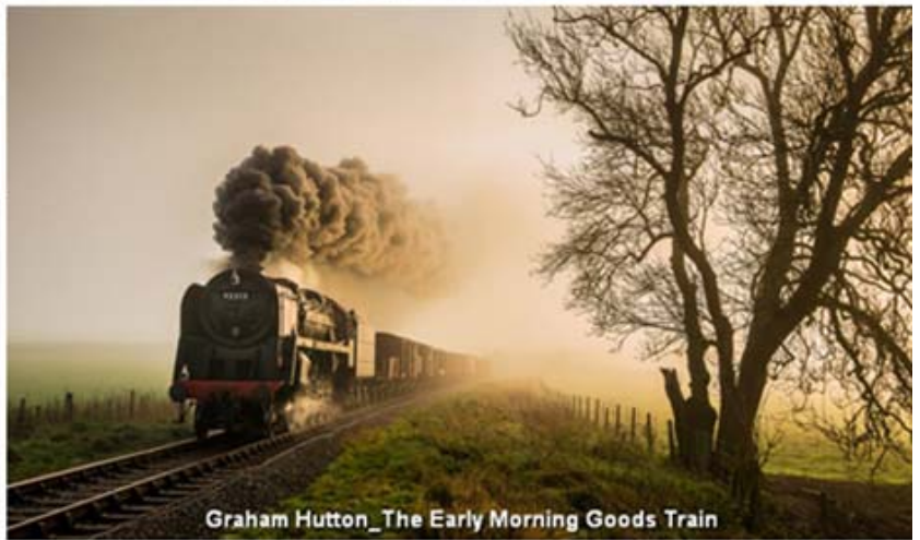
Graham Hutton_The Early Morning Goods Train