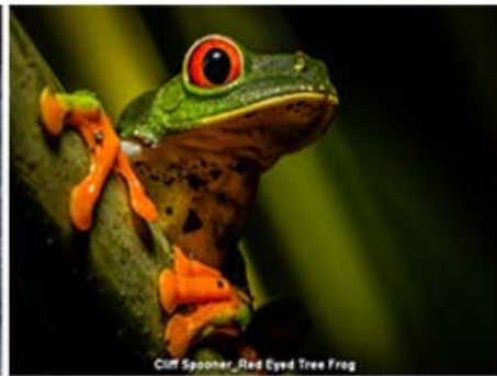
Cliff Spooner_Red Eyed Tree Frog