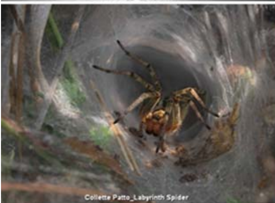
Collette Patto_Labyrinth Spider