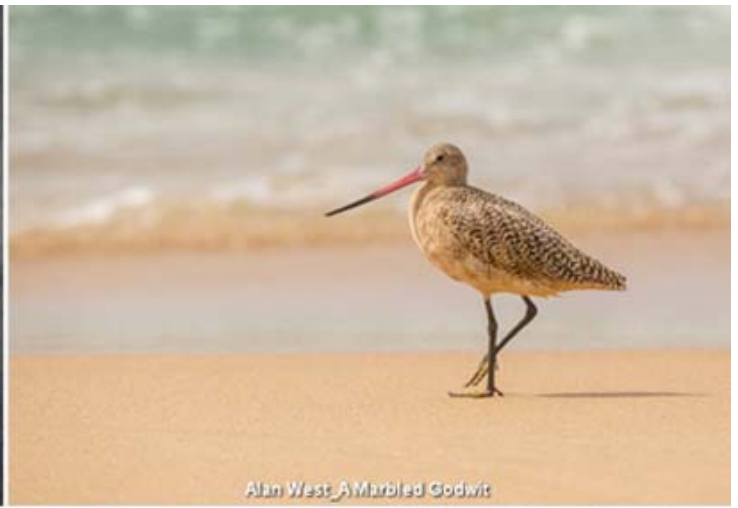
Alain West_A Marbled Godwit