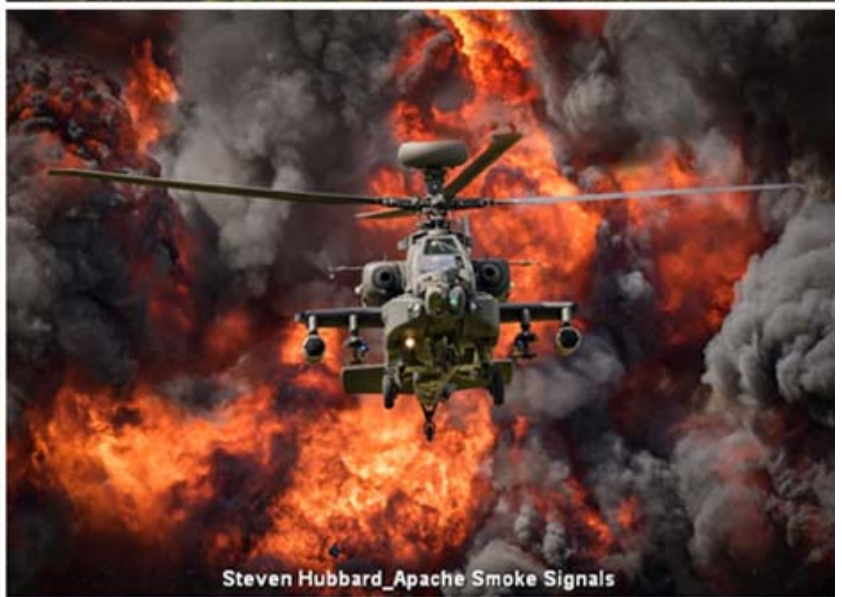
Steven Hubbard_Apache Smoke Signals