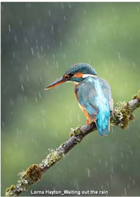
Lorna Hayton_Waiting out the rain