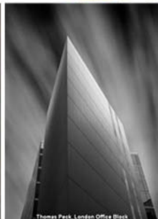
Thomas Peck_London Office Block