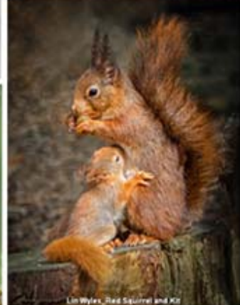
Lin Wyles_Red Squirrel and Kit