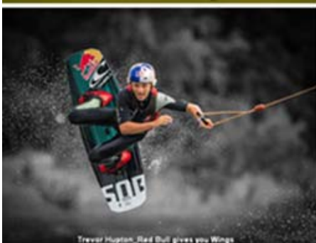
Trevor Huxton_Red Bull gives you Wings