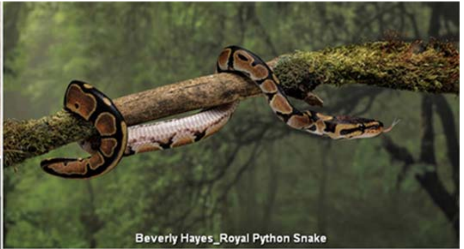
Beverly Hayes_Royal Python Snake