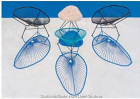
David MacGowan_Three Light Structures