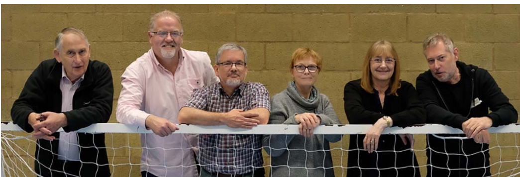
< The Adjudicators