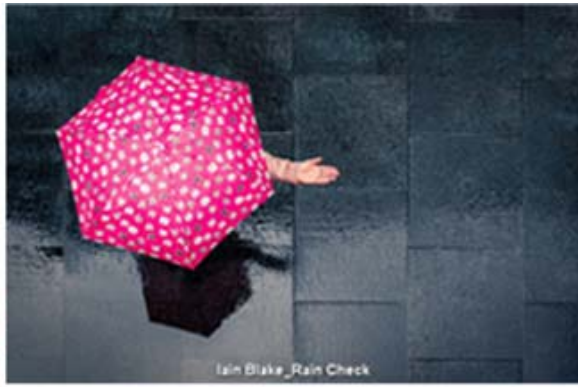
Iain Blake_Rain Check