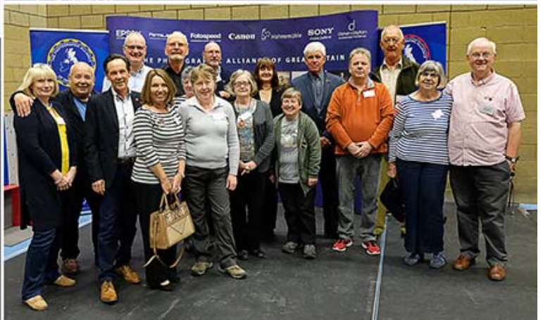
above. The NWPA Team