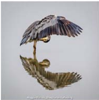
Waggy's Wings_grey heron in flight