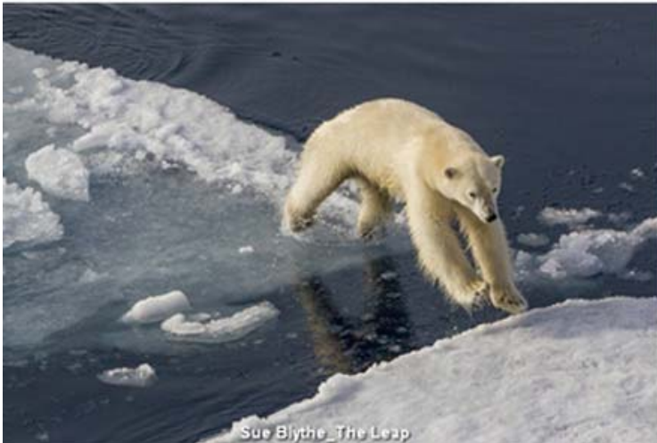
Sue Blythe_The Leap