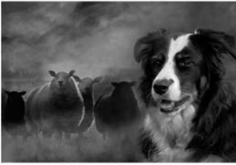
Alan Young The-Sheepdog