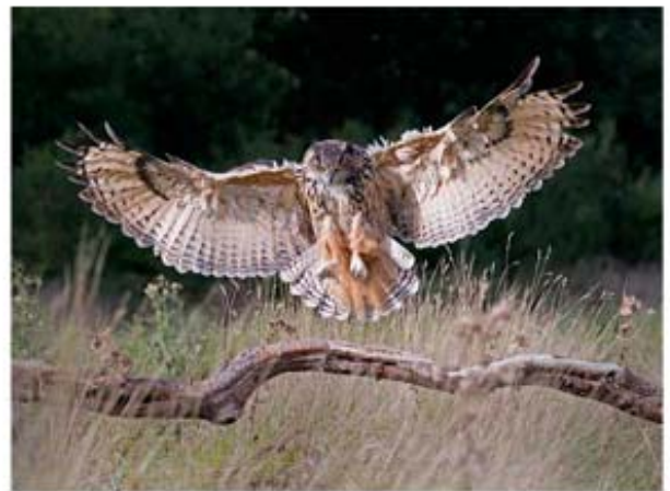
Keith Wood Eagle-Owl-7