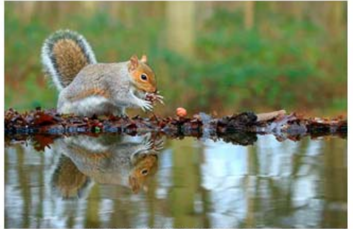
Grey-Squirrel-drops-nut