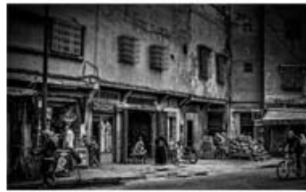
Lawrence Homewood Life-in-Old-Marrakesh