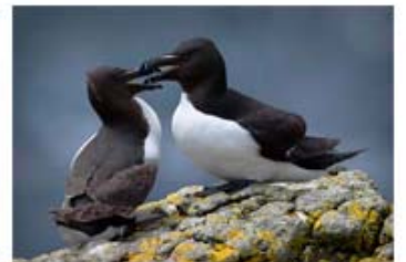
Will Stead Razorbill-Interaction