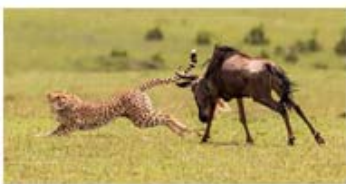
Rita Daubeney Cheetah-and-Wildebeest