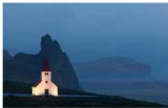
Sheila Tester Church-at-Vik