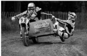
Malcolm Rapier Counterbalance