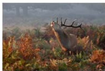
Prashant Meswani Stag-Deer-Bellowing