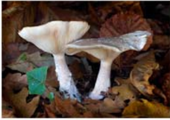
Peppery-Milkcap