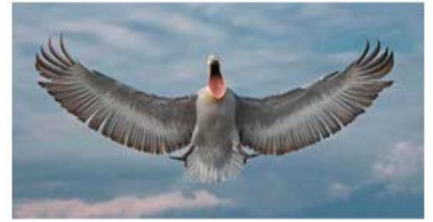
Greg Duncan Dalmation-Pelican-Spread.jpg