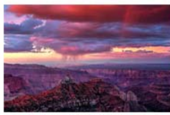
Simon Allen Storm-over-Marble-Canyon