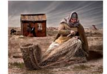
Frances Underwood The-Fisherman's-Wife