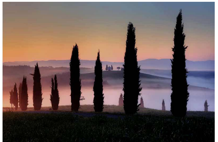
Val d'Orcia Cappella di Vitaleta