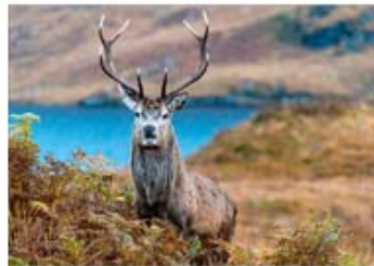
Stag-in-Loch-Arkaig