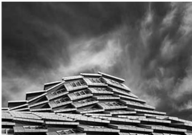
Ian Thomson The-Mound.jpg