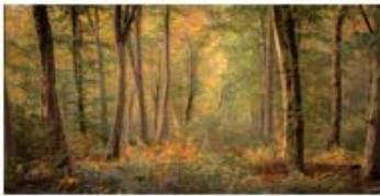
Caroline Broom Creech-woods