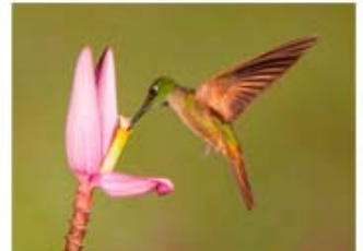
Fawn-Breasted-Brilliant-Hummingbird