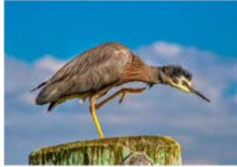
White-Faced-Heron