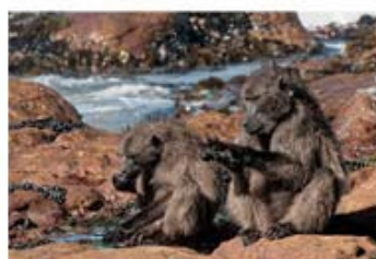
Chacma-Baboons-feeding-on-Shellfish