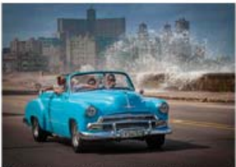
Pat Barbour Driving-along-the-Malecon