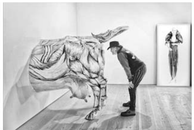
Yin Wong Behind-the-cow