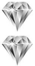
Suspicious by Barry Mead EFIAP Diamond 2