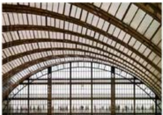
Rolf Kraehenbuehl Human-Ants-behind-Glass