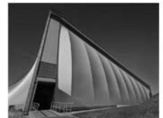
Roger Paxton Back-to-the-future-Part-1