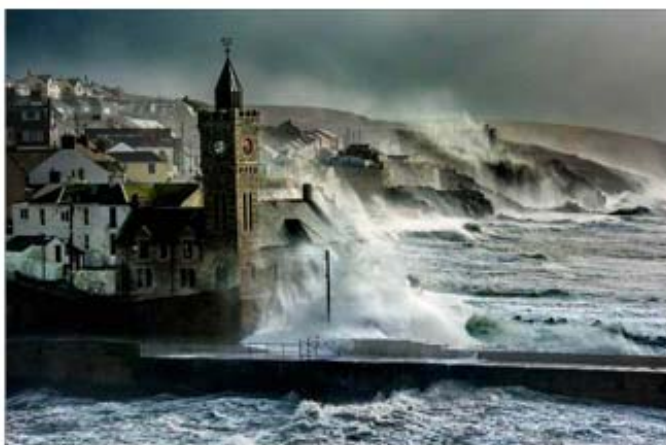
Martin Fry Atlantic-Storm.jpg