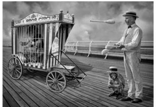
Jeanette Duncan The-Circus-Sideshow.jpg