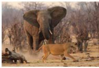
Brian Trout African-Standoff