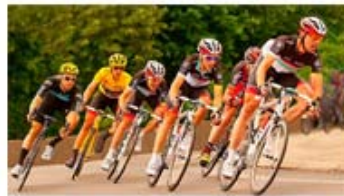
Cancellara-Chasing-the-Breakaway