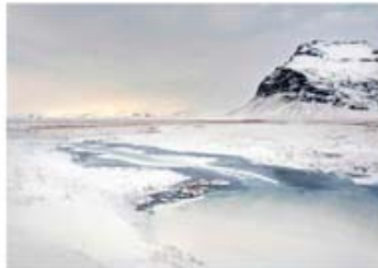
Pat Broad Frozen-Pool-&-Mountain