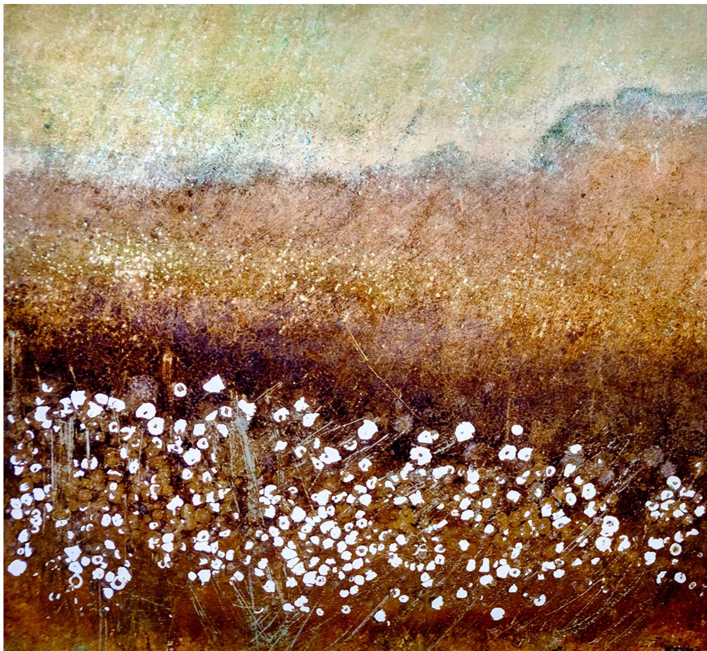
Wayside Flowers by Heather Woodhams, a 2018 London Salon Medal winner

See the notice in this e-news , for details of the London Salon 2018 exhibition venues