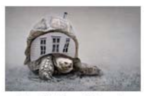
Janine Ball_Grand Designs.jpg