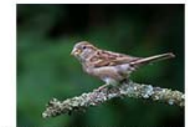
Lesley Betts_Female House Sparrow With Mea...