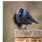
Diana Graham_The Lookout.jpg