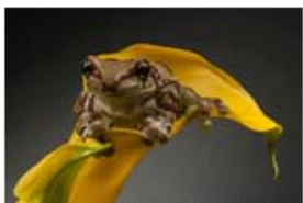
Martin Coupe_Amazon Tree Frog.jpg