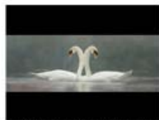
Yvonne St Cyr_Mute Swans in Courtship Displ...