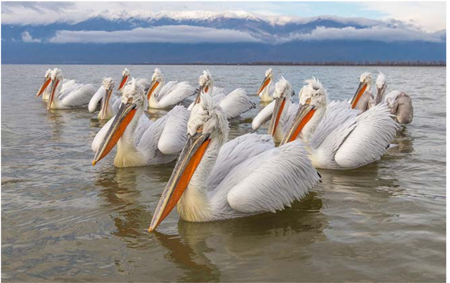
"Pelican Pod, Lake Kerkini"