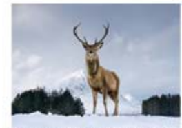
Keith Thorburn_Highland Stag.jpg