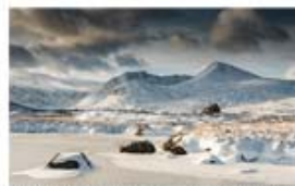
Kenny McGuckin_Winter Landscape.jpg