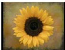
Wendy Stowell_Sunflower .jpg