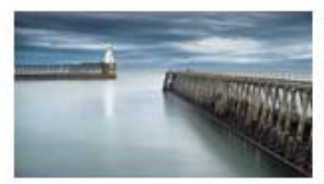
Jim Munday_Blyth Harbour.jpg