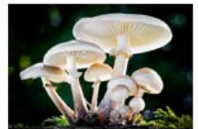
Louise Borbely_Porcelain Fungus.jpg