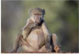
Susan Green_Lost in Thought. .jpg