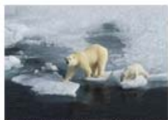
Sue Blythe_Living on thin ice.jpg